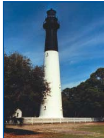
Lighthouse in March of 2002.