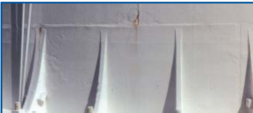
One of the few corrosion spots observed on lighthouse in 2002. This spot occurred at one of the plate seams.

grow on the northwest side, but could probably be easily remedied with a bleach cleaning and pressure washing. Today, after twenty years of service, waterborne acrylic coatings are still protecting the Hunting Island Lighthouse from the elements, and provide an aesthetically pleasing exterior for the more than 1 million annual visitors to the Hunting Island State Park. After 127 years, this historic landmark deserves nothing less.