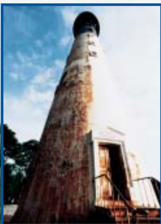
Lighthouse in 1982 prior to restoration, showing heavy corrosion on northwest side

In 1981, a Rohm and Haas employee was vacationing on Hunting Island and noticed that the lighthouse was in bad disrepair. There were holes in the cast iron ranging in size from 1/4 to 2 inches in diameter. The alkyd coating that was applied seven years prior had deteriorated badly, embrittling and cracking, especially along the north side. Heavy rust spotting and run-down originating at the plate joints and the pitted areas had turned the once-attractive landmark into an eyesore. A complete restoration was planned.