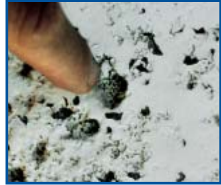
Close-up showing pits and holes in cast iron plates.

acrylic resin. Then gloss waterborne acrylic topcoats were applied to match the historical color scheme – white on the bottom and black on top. The total dry film thickness was approximately 9 mils.