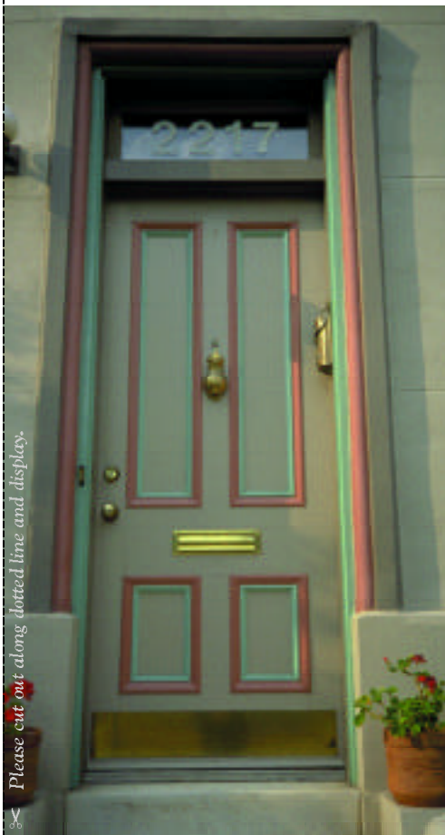
Please cut out along dotted line and display.

Using a paint with good color retention is important on multi-color exterior paint schemes.